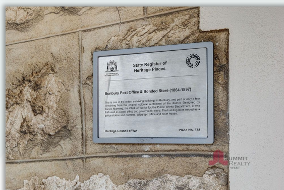
Historic Bunbury Building