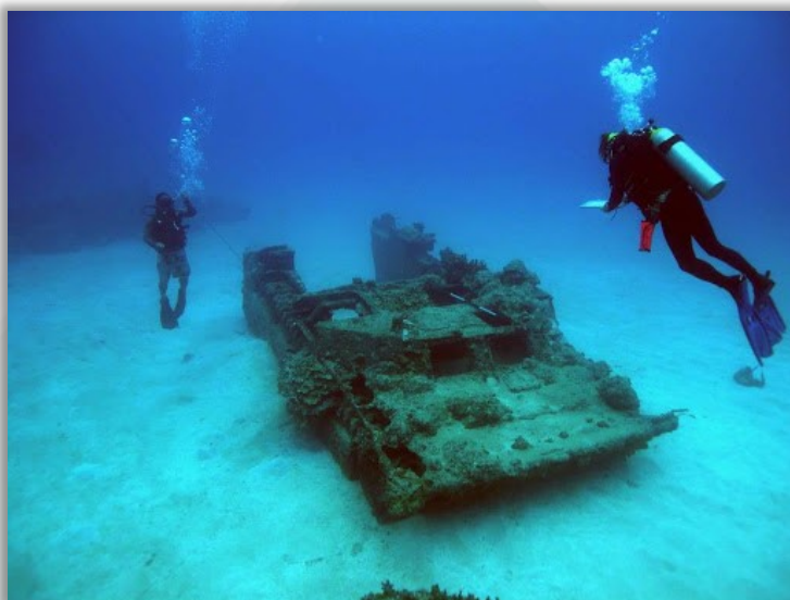
Amphibious Tractor

Our team at Integrate Sustainability develop procedures and plans to assist with managing and preserving heritage sites. If you require assistance with heritage matters, please contact us via enquires@integratesustainability.com.au or phone 9468 0338.