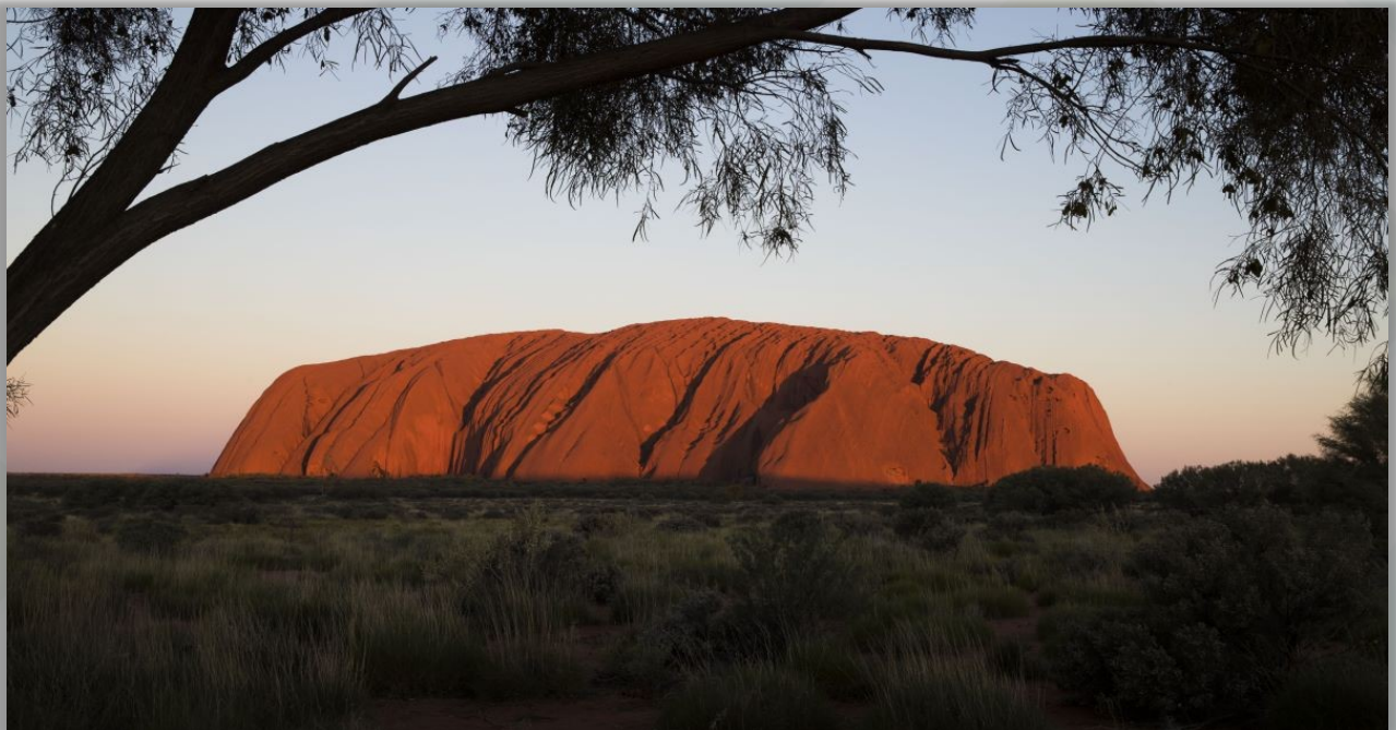
Uluru (Tourism NT, 2021) Source: Australia's Northern Territory

World Heritage sites belong to everyone, irrespective of where they are located around the world. The World Heritage Convention administered by the United Nations Educational, Scientific and Cultural Organization (UNESCO) aims to promote cooperation among nations to protect heritage worldwide. World heritage sites have been nominated by UNESCO for having cultural, historical, scientific or another form of significance that is of outstanding universal value. Australia currently has 20 properties on the World Heritage List (DAWE, 2021).