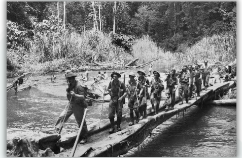
Battalions crossing Brown's River

With this new list, Australia can recognise and celebrate those overseas places of greatest importance to the development of our nation in a way that is respectful of the rights and sovereignty of other nations (DAWE, 2021).